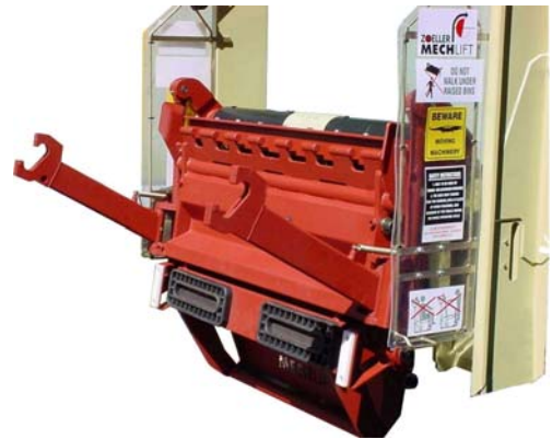
Non standard model shown here, klap-arms are an optional extra.

The ML 325 uses the same technology as the ML 310, which has proven it's self to be one of the best high level lifters on the market over the past ten years. The single comb means that the larger bins are easily loaded and emptied. It also means that only a single operator is required and since there are fewer working parts, maintenance and purchase costs are reduced.